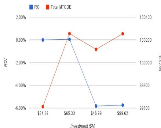
Figure 5: ROI (%) and GHG Emissions (MTCDE) vs. Investment Cost ($M) across the Four Investment Options.