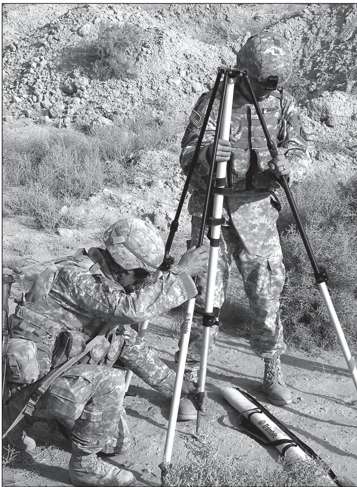
Personnel from the 243d Construction Management Team set up a surveying beacon near Patrol Base Dragon in Iraq.

Further, engineer leaders at all levels are being asked to provide oversight and assistance for the life support of our Soldiers through base camp and life support construction. The mission of quickly establishing and maintaining safe and secure contingency operating locations of all sizes is a task that is dumped into the engineer's lap in our current contingency operation. Facilities engineering skills—to include environmental assessments, master planning, life-cycle costing, and maintenance oversight—are skills that have not been stressed in our professional force. Because of the overwhelming use of and need for these skills as we continue the War on Terrorism, the United States Army Engineer School (USAES) should develop a cell that can ensure the development and maintenance of certain core competencies that our engineer leaders need to meet the challenges of this war.